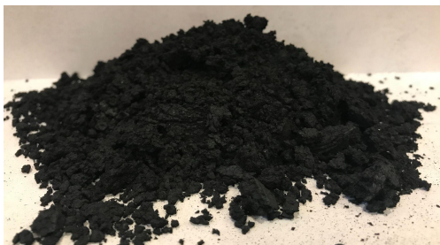
(black CNT powder at macro scale)